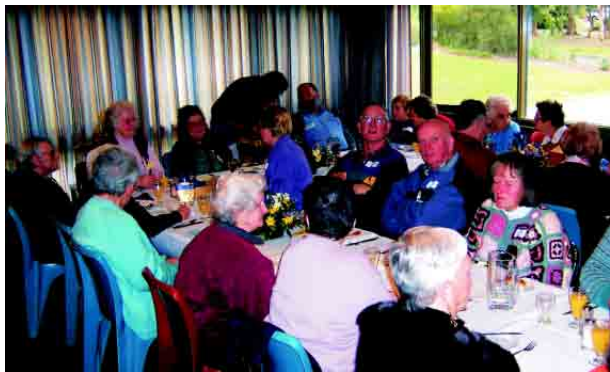
Enjoying a meal with some friends

The Disabled People's Company meets weekly, on Wednesdays from 10.00am to 12 noon at the Mooroolbark Community Centre. If you are disabled and looking for company and support, why not join us? Carers are welcome also.